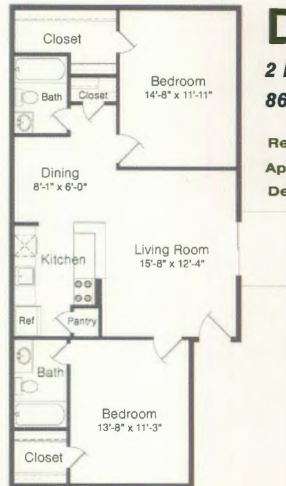
D 2 Bed / 2 Bath 863 Sq. Ft.*

Rent: _____ App. Fee: _____ Deposit: _____