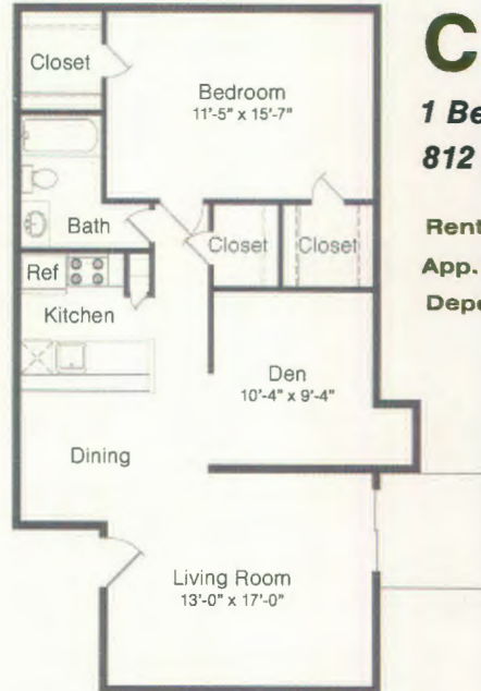
C 1 Bed / 1 Bath / Den 812 Sq. Ft.*

Rent: _____ App. Fee: _____ Deposit: _____