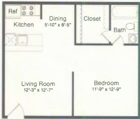
A 1 Bed / 1 Bath 504 Sq. Ft.*

Rent: _____ App. Fee: _____ Deposit: _____